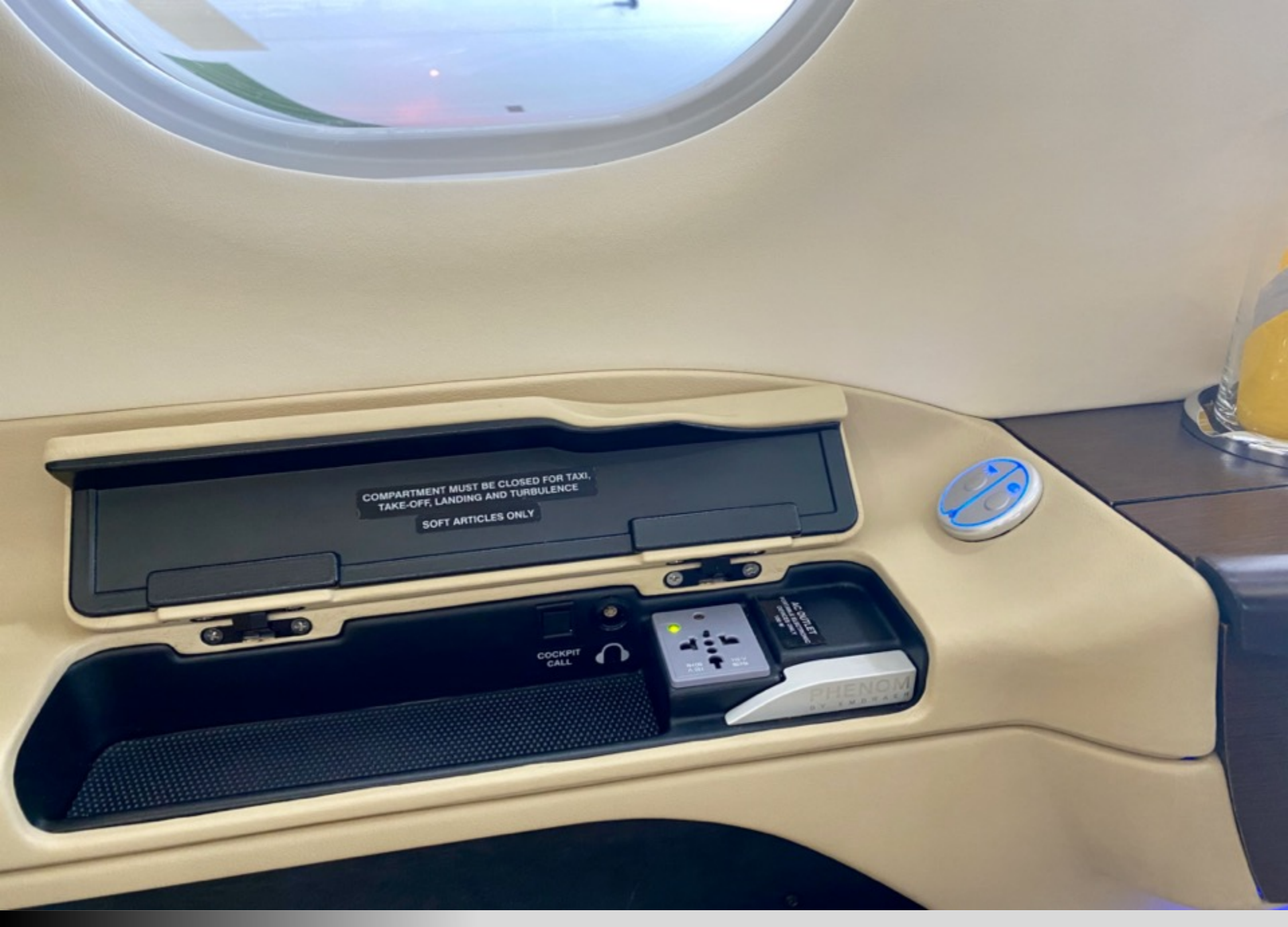
Specifications are subject to further review and verification by purchaser