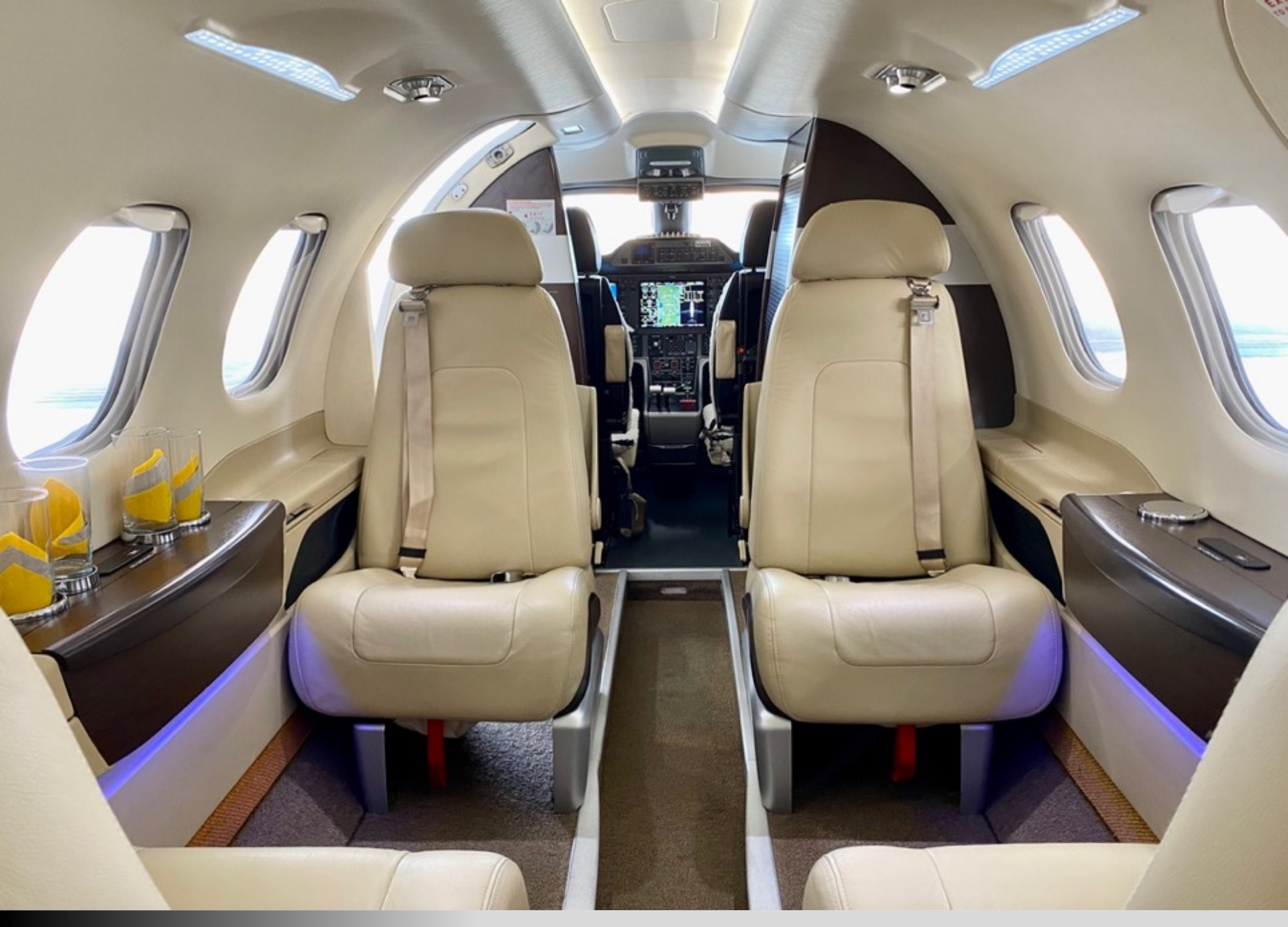
Specifications are subject to further review and verification by purchaser