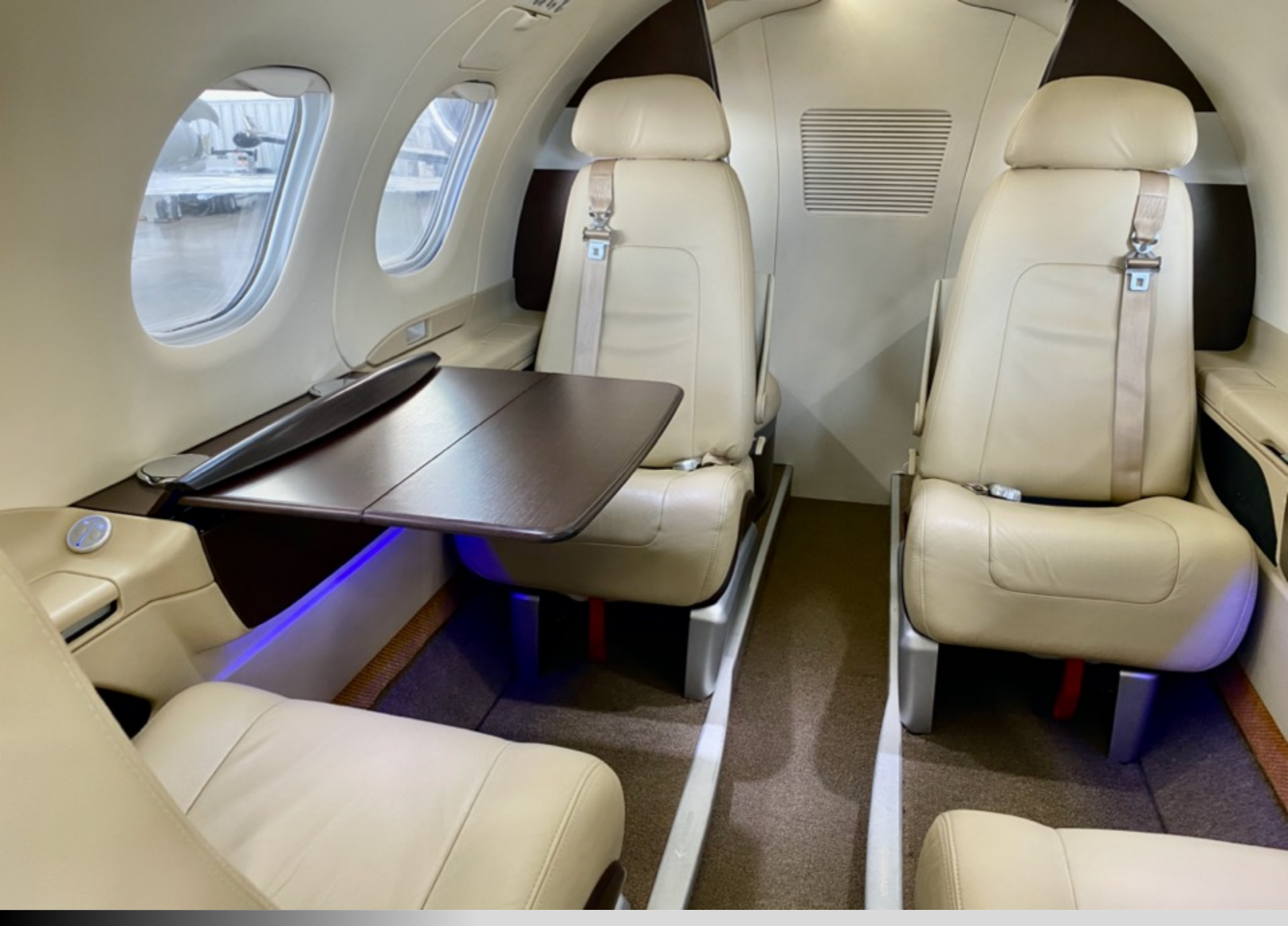
Specifications are subject to further review and verification by purchaser