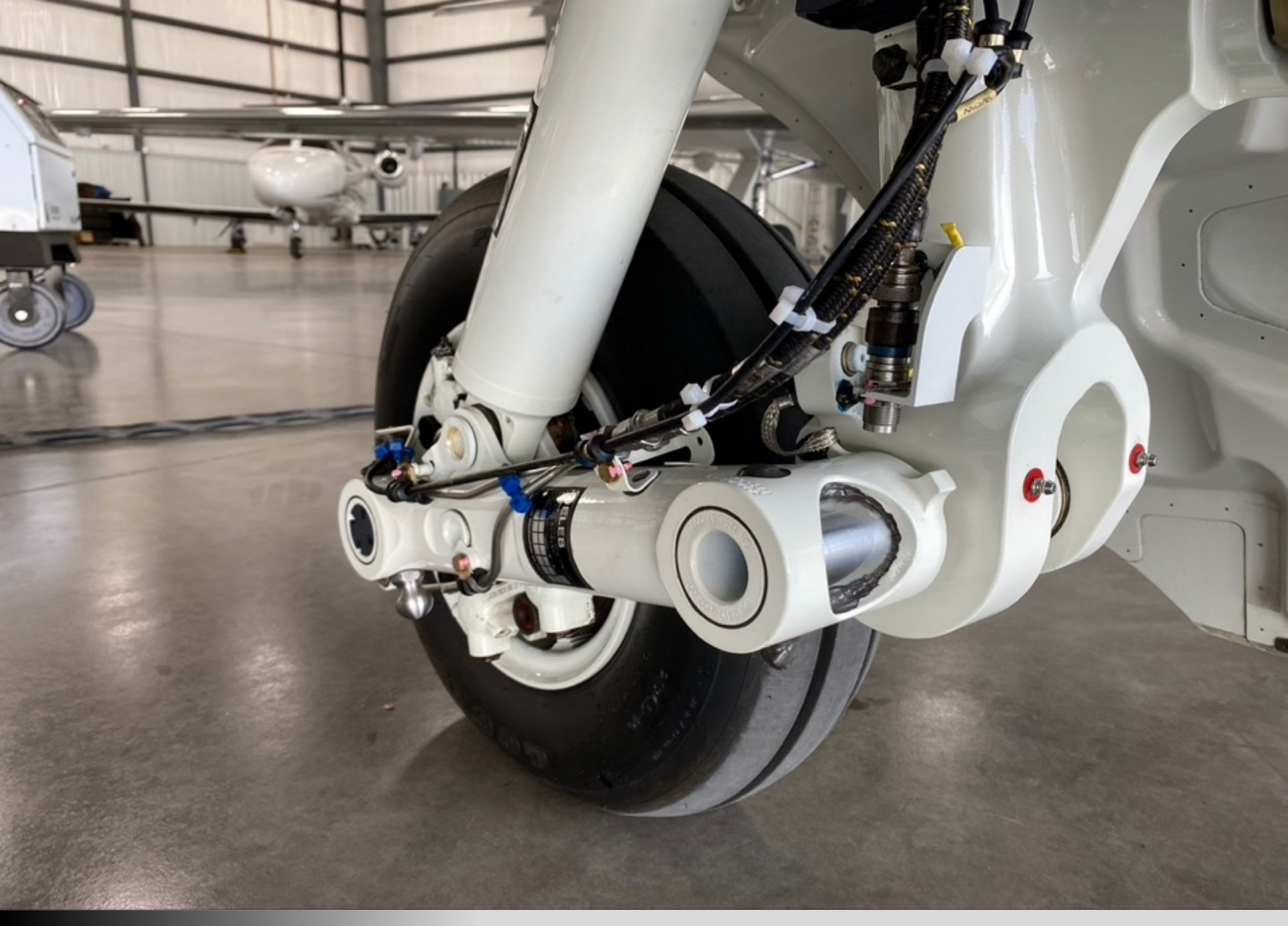
Specifications are subject to further review and verification by purchaser