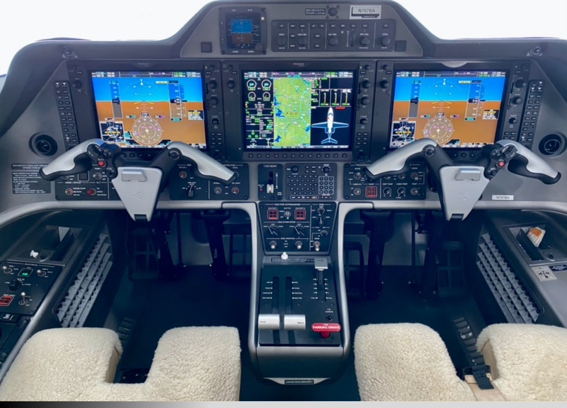
Specifications are subject to further review and verification by purchaser