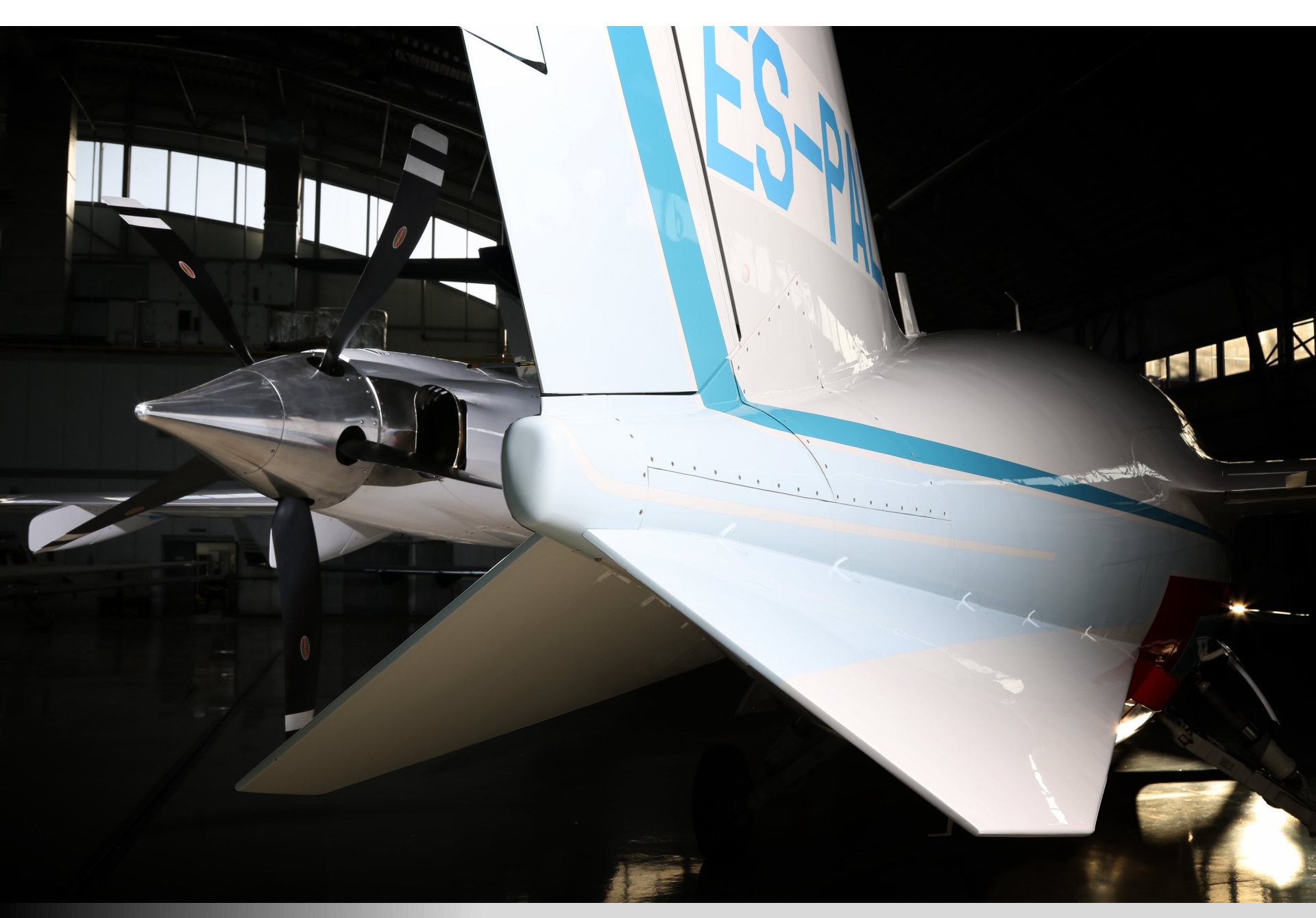
Specifications are subject to further review and verification by purchaser